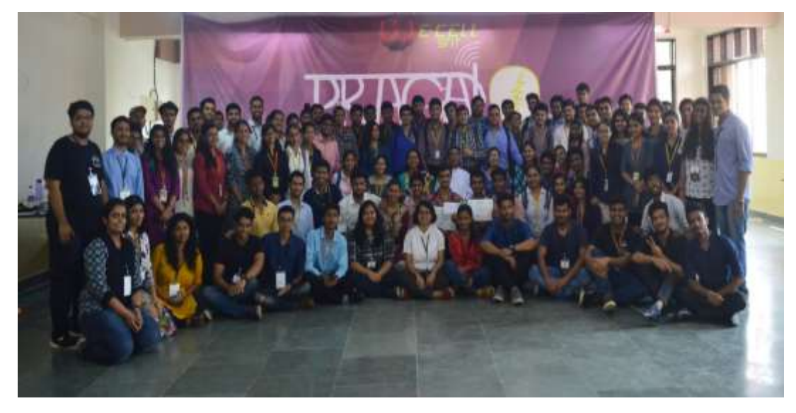
SFIT-E-cell Team with Pragati 2018 participants

Number of SFIT faculty, staff and students visited project competition, panel discussion and start up talks.